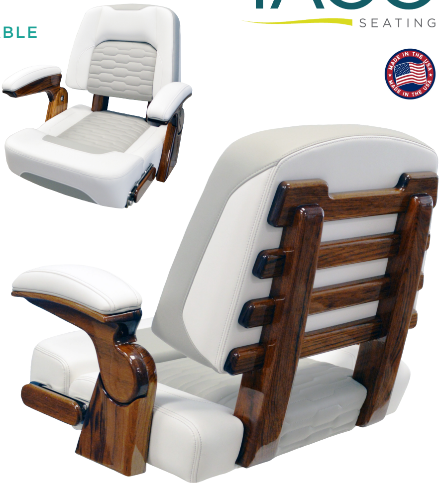
Concept renders shown. Final product subject to change.